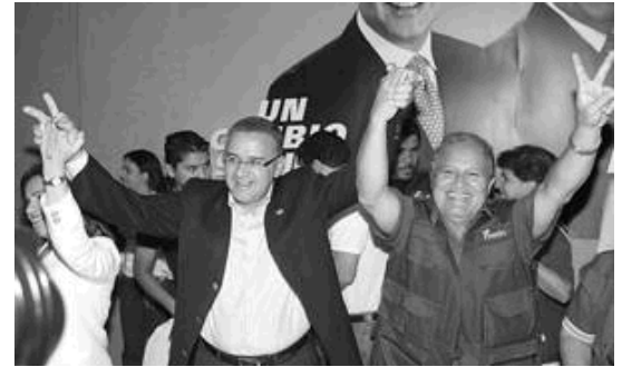
Mauricio Funes, President-elect of El Salvador

To find out how you can get involved in kNOw US and THEM, contact PICA.