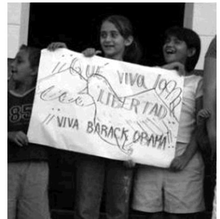
Carasque youth welcome the Lis- tening Project Delegation November 2008

We are excited about our new collaboration with Operation Breaking Stereotypes ( www.operationbreakingstereotypes.org ), an Orono, Maine-based program that partners Maine high schools with schools in Brooklyn and the Bronx, New York. We are working with OBS to integrate our Listening Project approach of careful, non-judgmental listening, and our findings about immigration, trade, and economic pressures into the exchanges between the schools, helping students connect these concerns to their own experiences. The work has already started, with material from PICA's Listening Project interviews being incorporated into a reader's theater presentation by Old Town High School's OBS students in February.