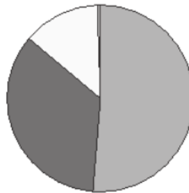
2009 Budgeted Expenses